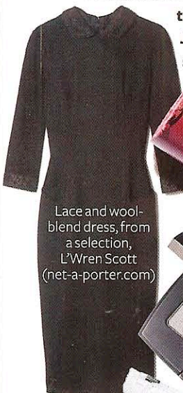
Lace and wool-blend dress, from a selection, L'Wren Scott (net-a-porter.com)