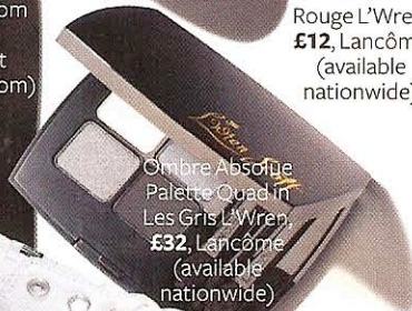
Ombre Absolu Palette Quad in Les Gris L'Wren, £32, Lancôme (available nationwide)