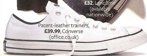
Patent-leather trainers, £39.99, Converse (office.co.uk)