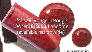
L'Absolu Rouge in Rouge L'Wren, £18.50, Lancôme (available nationwide)