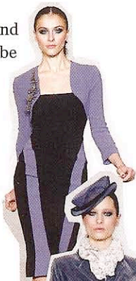
L'WREN SCOTT A/W 2010

"Before creating my range, I imagined the make-up lab to be very James Bond. I was nervous stepping into the lab and